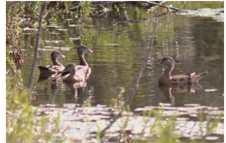
Wood Ducks

The WDNR was scheduled to implement a Fyke net study this last spring but the Covid 19 pandemic forced a cancellation of all their surveys for the year. They did manage to complete a shock survey in October, 2020 with the focus on Walleye recruitment (reproduction) from the spring. The survey showed a significant decline in Walleye fingerlings from the spring spawning period. This is the first time in a number of years that the reproduction was down but there are many factors that may have altered the survey. Although the WDNR Fish Biologist is not overly concerned at this point, they told me that negative survey results do happen. It is also a very possible sign of overfishing, something that Windigo has been experiencing over the last few years.