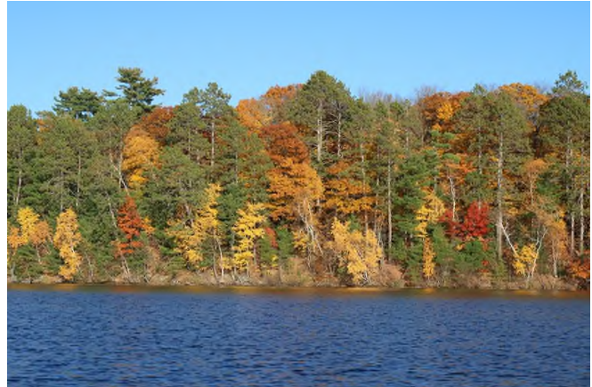
Windigo Shoreline Fall 2020

In addition to the above, we created a survey for Association members to complete in an effort to determine the level of concern with the water level. Additionally, this information may help us identify what steps we as an association, as well as individual lake shore owners, might be willing to take to help mitigate the above. To that end, we ask that you complete the online survey to help us understand your views on this topic.