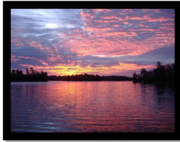
Windigo, an Island Lake with Natural Shoreline

(For property owners and friends of Windigo Lake, Lake 27, and Hub Lake)