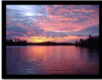
Windigo, an Island Lake with Natural Shoreline

(For property owners and friends of Windigo Lake, Lake 27, and Hub Lake)