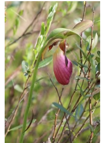
Pink Lady Slipper in Windigo wetland