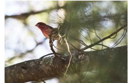
Purple Finch on Windigo