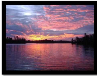
Windigo, an Island Lake with Natural Shoreline

(For property owners and friends of Windigo Lake, Lake 27, and Hub Lake)