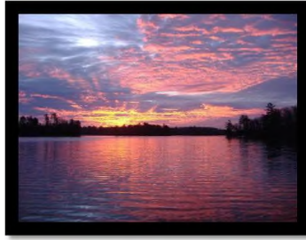
Windigo, an Island Lake with Natural Shoreline

(For property owners and friends of Windigo Lake, Lake 27, and Hub Lake)