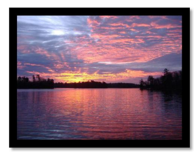
Windigo, an Island Lake with Natural Shoreline

(For property owners and friends of Windigo Lake, Lake 27, and Hub Lake)