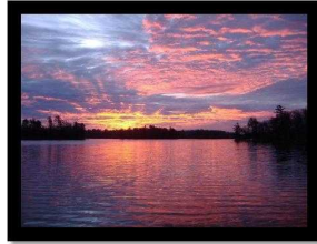
Windigo, an Island Lake with Natural Shoreline

(For property owners and friends of Windigo Lake, Lake 27, and Hub Lake)