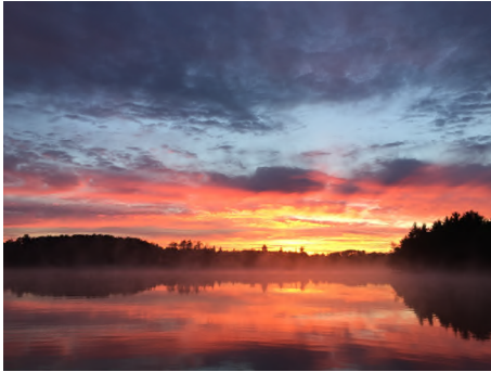
Windigo Sunrise